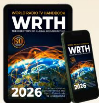
2026 WRTH E-book

Pre-order stars: Wednesday, September 24, 2025 Pre-order ends: Friday, October 31, 2025