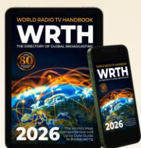
2026 WRTH E-book

Pre-order stars: Wednesday, September 24, 2025 Pre-order ends: Friday, October 31, 2025